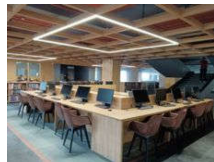
Digital Access Zone